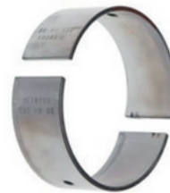
CON ROD BEARING A4376188