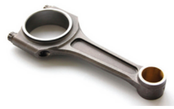
CON ROD A5257364