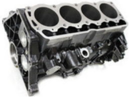
ENGINE BLOCK A5317169