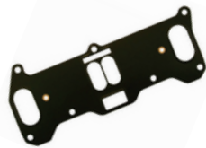
LOWER GASKET SET A4376379