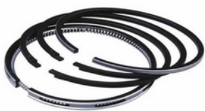
PISTON RINGS A4955366