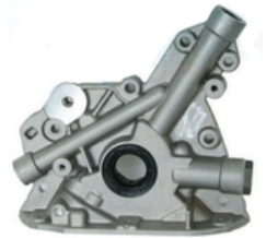
OIL PUMP A5284663