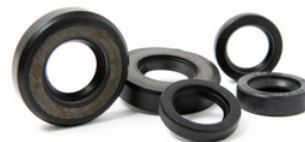
OIL SEALS FRONT - A4890832 REAR - A3968563