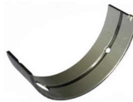
MAIN BEARINGS A5290097