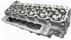
CYLINDER HEAD A5258275