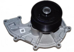
WATER PUMP A5314728