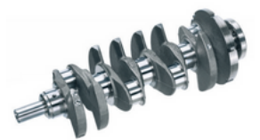
CRANK SHAFT A5272079

For accurate identification of your requirements please give us a call. There is no liability taken for incorrect ordering of parts if you select from the above. Illustrations are samples only and are not specific to the part.