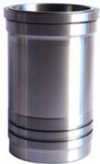
CYLINDER LINER A4919951